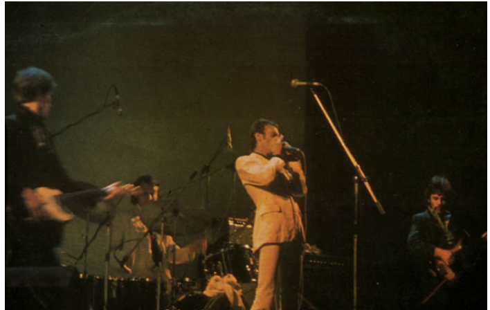
Figure 2 UK RnB band Dr. Feelgood

The Blues in common parlance is both a state of mind and the musical idiom- 'a bout of depression; melancholic music of black American folk origin, often in the twelve bar sequence'. 2