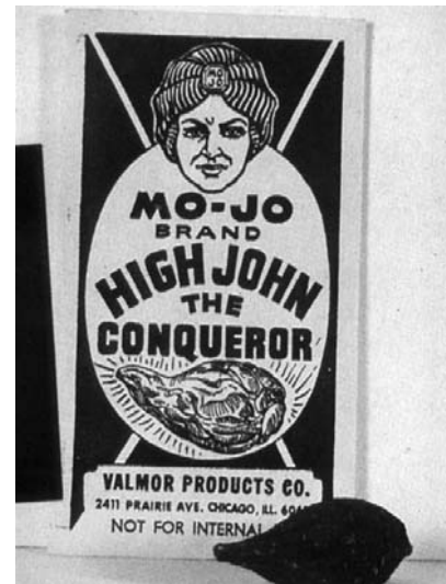
Figure 4 John the Conqueror 'Mojo'

The formal Blues probably emerged in the early 1900s. The first recorded Blues was Mamie Smith's 'Crazy blues' in 1920. Blues shares a common ancestry with jazz for we find Dr Jive, Jelly Roll Morton, plying twelve bar jazz numbers, along with WC Handy and King Oliver, while the 'Classic Blues' women performers were making the blues a household commodity 5