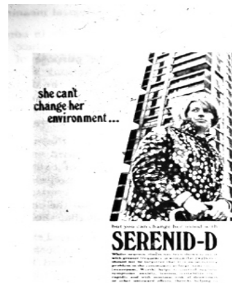
Figure 31 The ultimate technological fix?

Massive prescribing of psychotropics 9 still suggests tacit acceptance of Medicine's legalized drug-pedaling as social control. Citizens advice bureaux services in general practice are beginning to show more appropriate responses to social and emotional problems, prescribing debt counselling, welfare rights or employment advice instead of anti-depressants. 10 The medical school adage was not to drug reactive ('understandable') depression. How often is the patient still receiving the medicated potion that don't improve emotion? 11,12