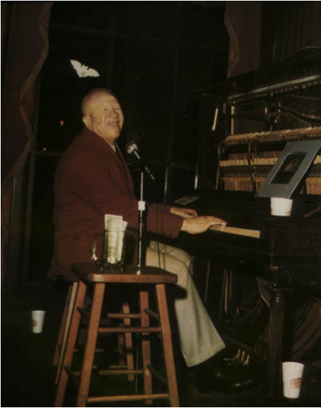
Figure 1 Piano Red, the original Dr Feelgood.